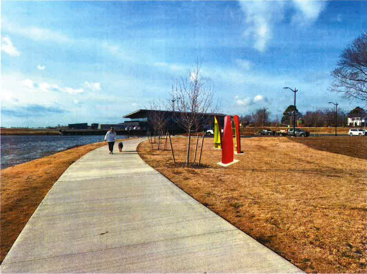
Mockup of approximate installation location above.

Canoe Canoe by Jeff Zischke will be made of re-purposed aluminum canoes that are re-conditioned and re-painted (exact colors are TBD), with a seat and installed to act as a sculptural conversation piece. We would like to install them near the water's edge at Lake Bentonville inviting people to sit, relax and enjoy the environment.